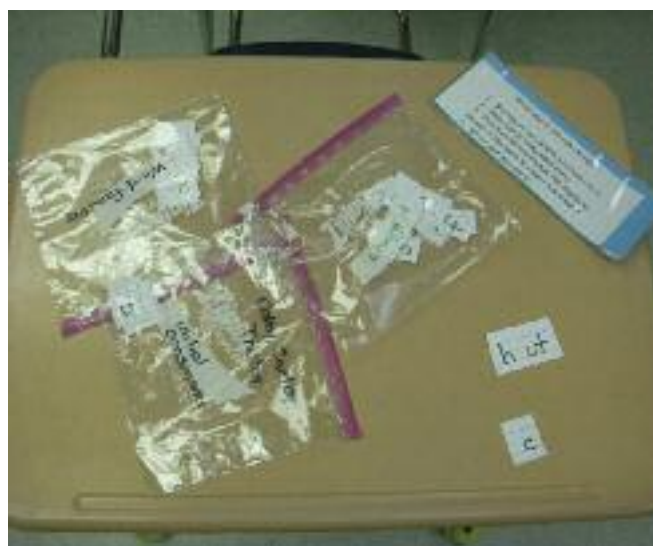
Figure 4b. Letter Cards for Word Works Phonics Station

Content crossover is a useful way to meet content standards as well as to help students develop a depth of learning. For example, one student demonstrated that he was able to transfer a skill taught in the context of a lesson to a real life situation. When referring to a skill he just learned, he commented, "This is just like a candy machine because you have to push B1 to get the candy you want." Not only did the stu-